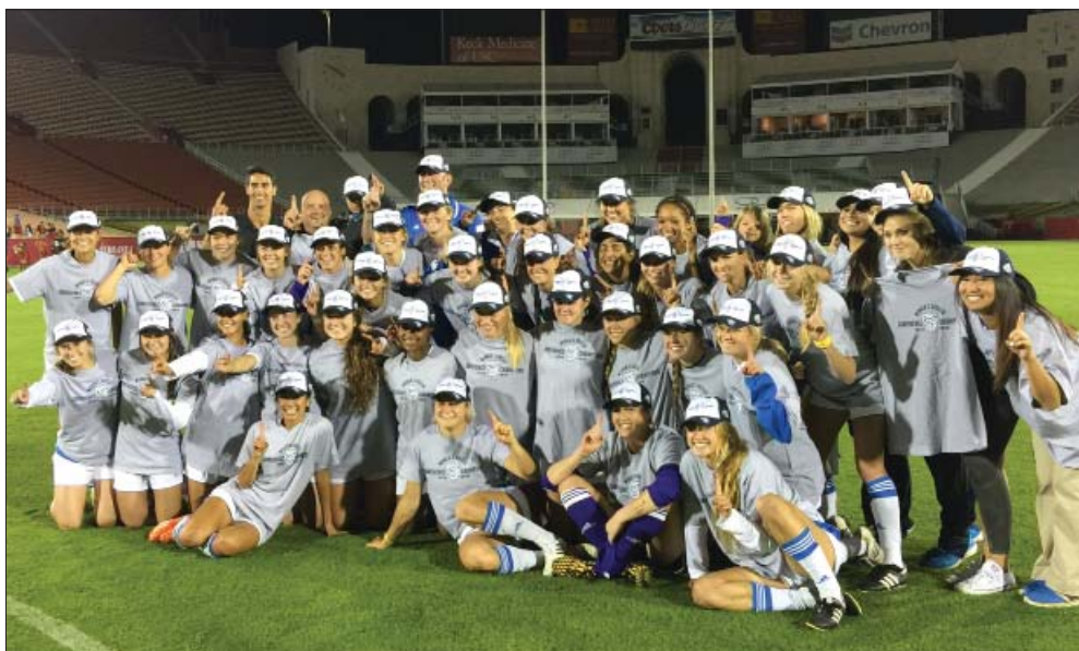
2014 Pac-12 Champions